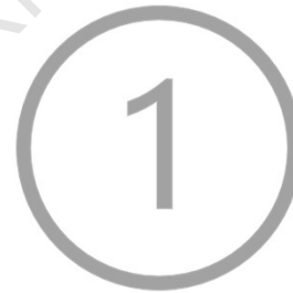
First-time Sex/ Hookups